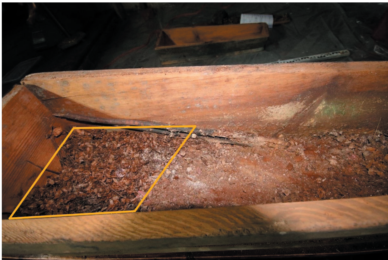
Fig. 2. Location of archaeobotanical sample with common hop.

of the Plant Ecology Department of the University of Gdańsk (CRefColl-UGDA) and herbal specimens from the Herbarium of Department of Plant Taxonomy and Nature Conservation of the University of Gdańsk (Herbarium Universitatis Gedanensis UGDA).