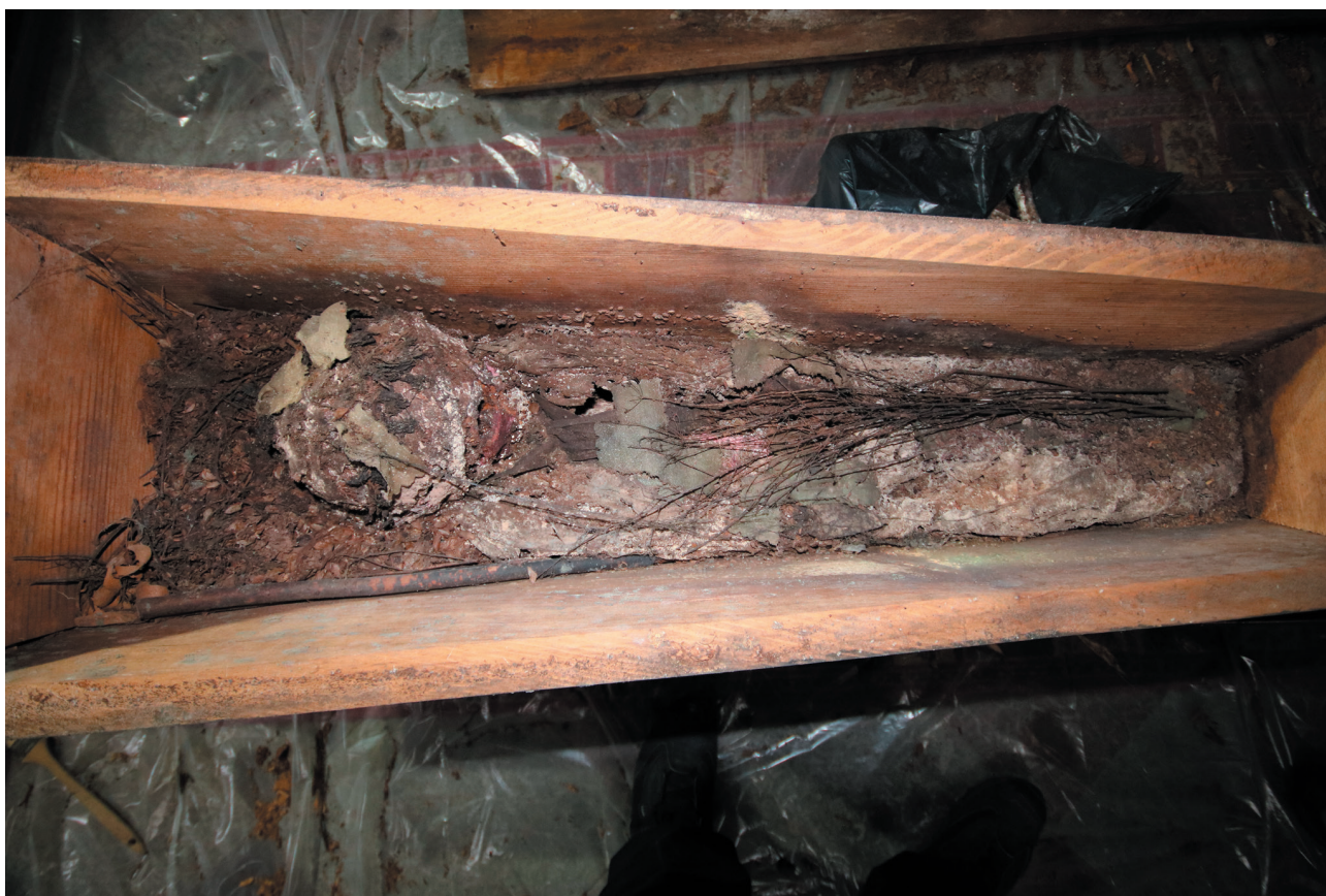
Fig. 1. Burial no. 37/2018 (phot. S. Nowak).

Material for macroremains analysis was dry-sieved on 0.2 mm and 0.5 mm sieves. Each fraction was sorted with the use of a stereoscopic microscope, while specialized atlases (Marek 1954; Kulpa 1974; Cappers et al. 2006; Cappers, Bekker 2013) were used for identification. The accuracy of the identification was compared with the collection of carpology collected in the Laboratory of Paleoecology and Archaeobotany