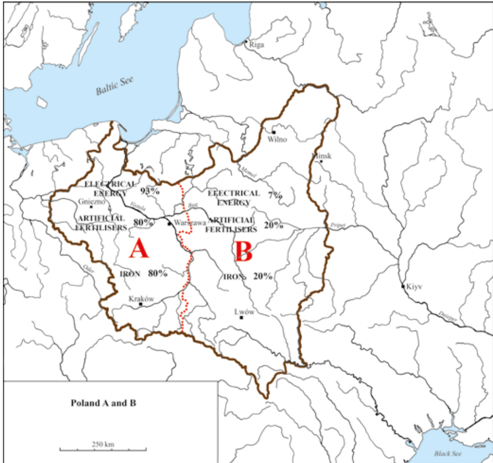
Fig. 3. Division of the country into Poland A and Poland B on the basis of selected indices of industrial production in the in the Second Polish Republic (Source: Z. Landau and J. Tomaszewski 1991, 64; redrawn by J. Ożóg)

sketch, prove the thesis, formulated already in the interwar period, about the virtually clinical and very detrimental developmental dichotomy of the Second Polish Republic. Although it was noticed by many, for the first dozen or so years of independence it was treated as a necessary evil and a phenomenon which could not be overcome. It was not until the experience of the Great Depression and Eugeniusz Kwiatkowski taking the position of Deputy Prime Minister in 1935 that things changed 8 .