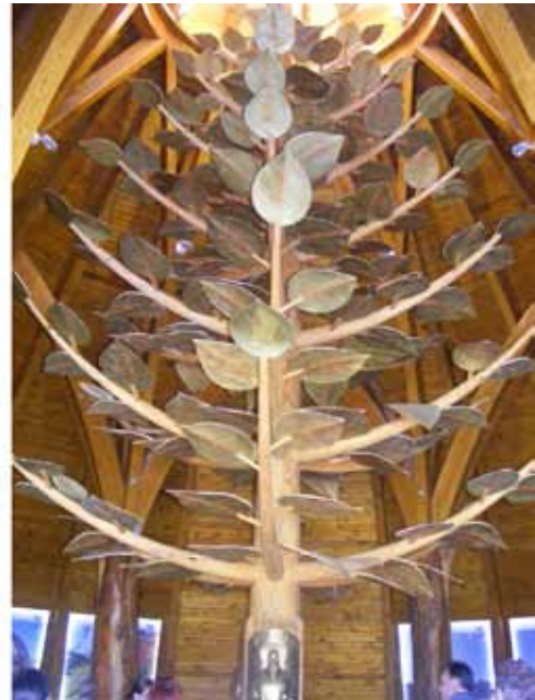
Fig. 8. Zalavár-Castle Island. Millennium monument of county Zala