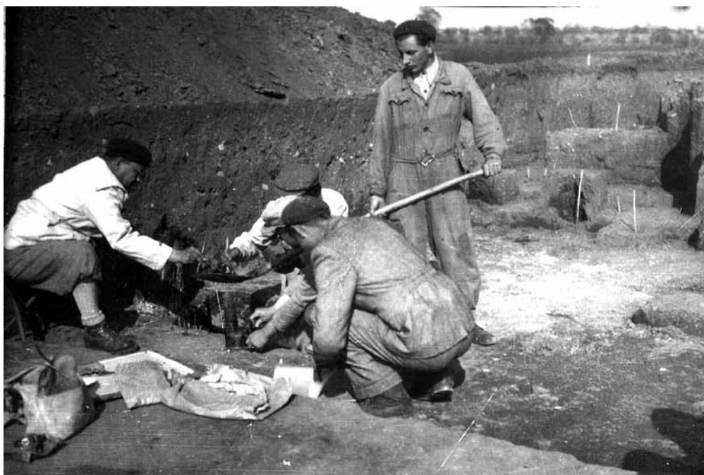
Fig. 1. Zalavár-Castle island. Excavations in 1953

Despite the high priority of the place, in the 1950s the possibility of presenting the excavated remains was not raised, for no stone walls