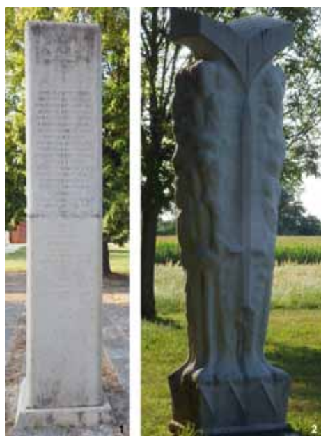
Fig. 6. Zalavár-Castle Island. Monuments of Salzburg Archbishopric (1) and Slovenia (2)