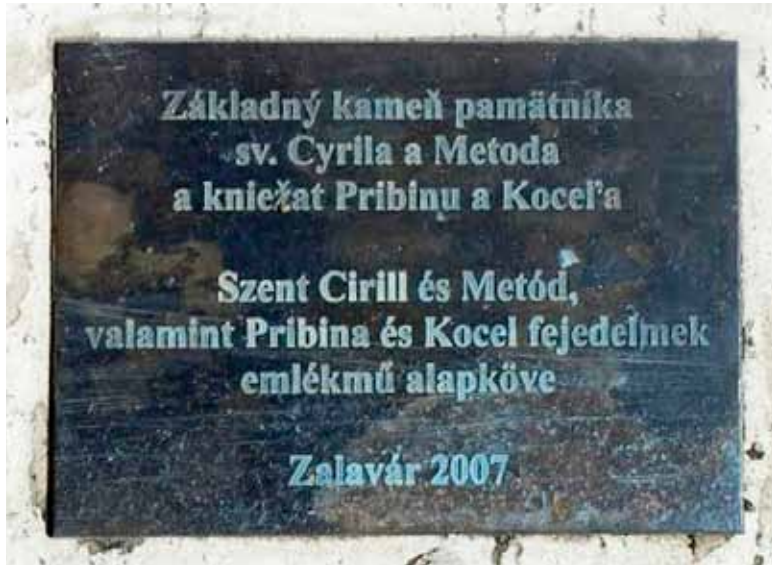
Fig. 7. Zalavár-Castle Island. Foundation stone of Slovakia's monument