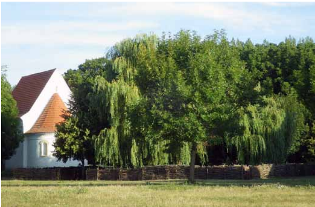
Fig. 2. Zalavár-Castle Island. The reconstructed church and the twig labyrinth

The first remains suitable for presentation were found in 1953 – the foundations of a church – and in the 1960s – details of the foundation-trench of the enceinte wall of the monastery; both are dated to the last decades of the 11 th c. The latter, despite plans for conservation, were covered back, but in 1996 the church was reconstructed (in fact a new church was built), celebrating the 1000 th anniversary of the Hungarian conquest. With this reconstruction started the development of an archaeological park on Castle Island. The next element of this park was the presentation of the outlines of St. Hadrian's pilgrim church in 2000, together with a well and a (probable) brewery. The ploughing of the excavated area ceased, and a small museum was erected by the Transdanubian Water Management Directorate, where “small” archaeological, ethnographic, biological and water management exhibitions are shown; a “water playground” and a twig labyrinth were later added in the vicinity of the building (Fig. 2). Tourist traffic has increased, but a plan of proper arrangement is still badly needed for the whole Castle Island, as is the presentation of many more excavated