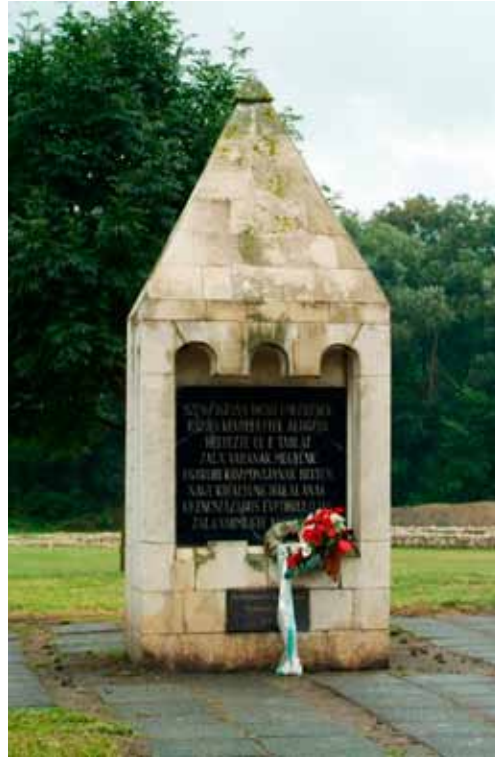
Fig. 4. Zalavár-Castle Island. The 1938 monument in 1985

celebrations are held. The first one was a black marble plate with a simple inscription dedicated to the work of St. Stephen (1938; set up by the Zala County). Between 1985 and 2010 this marble plate built into an aedicule became the nucleus of the memorial park being erected, together with the bronze statues of Saints Cyril and Methodius (1985; set up by People's Republic of Bulgaria, Eötvös Loránd University and the Zala County) (Figs. 4–5). A column reminds visitors of the activity of the Salzburg Archbishopric on the site (2000; set up by the Salzburg Archbishopric). The statue of a book and a sword recalls the memory of Chezil, Pribina's son (2005, set up by Slovenia) (Fig. 6). On the opposite side of the path only the foundation stone of Pribina's memorial was laid by Slovakia, since at that time (2007) relations between Slovakia and Hungary became fraught (Fig. 7). In 2010 the 1000 th anniversary of the Zala County was celebrated. In honour of it, a strange building was