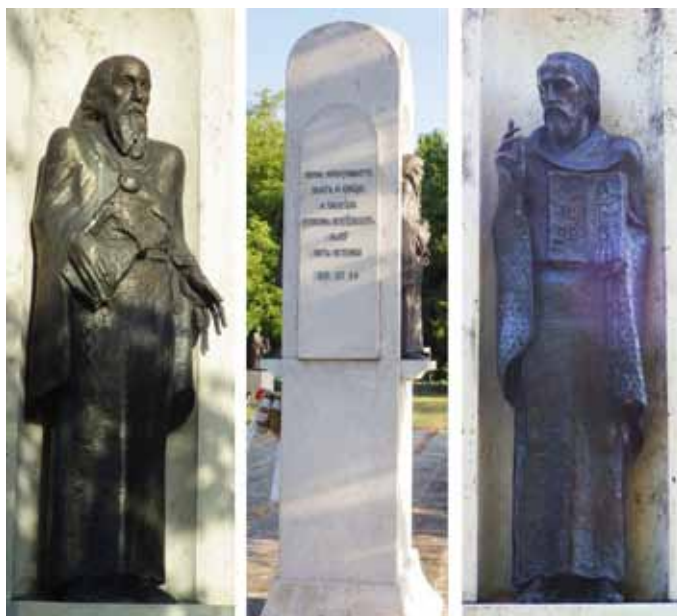
Fig. 5. Zalavár-Castle Island. The 1985 monument of Cyril and Methodius