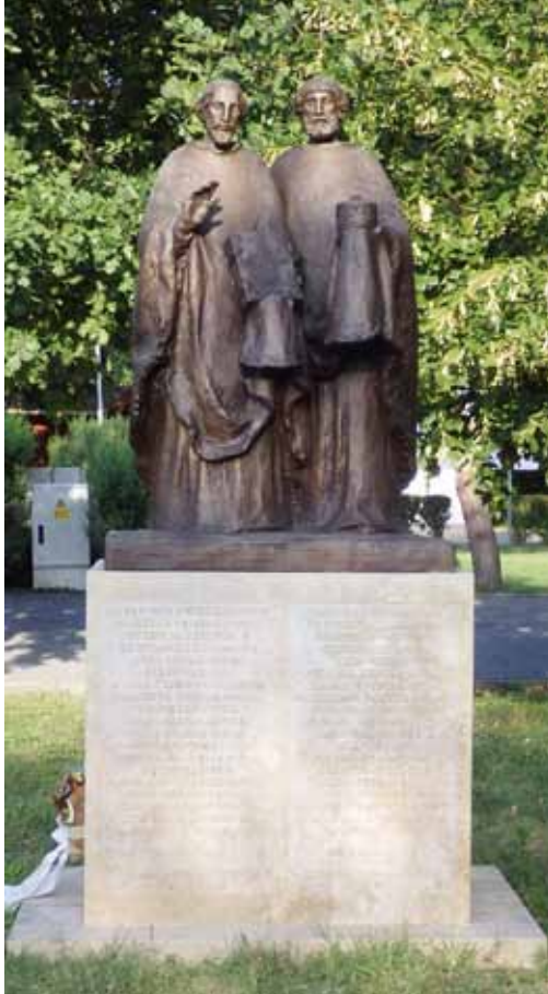
Fig. 9. Zalavár-Castle Island. The 2014 monument of Saints Cyril and Methodius

erected in the centre of Castle Island, based on an old design of Imre Makovecz, the famous organic architect and a native of the county. In the middle of the building there is a huge tree of life, its trunk surrounded by plastic leaves. On its plastic leaves the names of the settlements of the county are written (Fig. 8). Its purpose was questioned for a long time. Recently, wedding ceremonies have been held there. In 2010 the marble plate from 1938 and the aedicule from 1985 were broken and thrown into construction debris. Their pieces were placed, at the request and suggestion of archaeologists working in the field, on the southern facade of the church built in 1996. The most recent memorial is a scaled