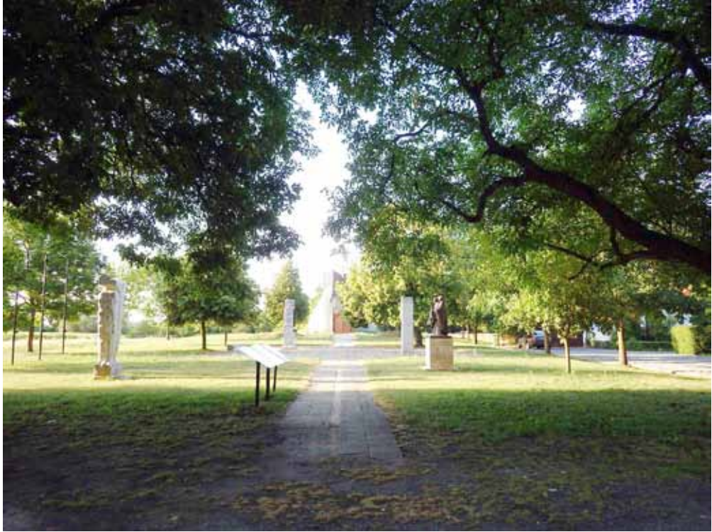
Fig. 10. Zalavár-Castle Island. The memorial park

down copy of the Saints Cyril and Methodius statue from Nitra (2014, set up by the Slovak minority's self-government in Budapest) (Fig. 9). The last two of the series, which were erected regardless of their visual intrusion or poor quality, indicate the disintegration of the Hungarian Monument Protection System from 2010 onwards (Fig. 10).