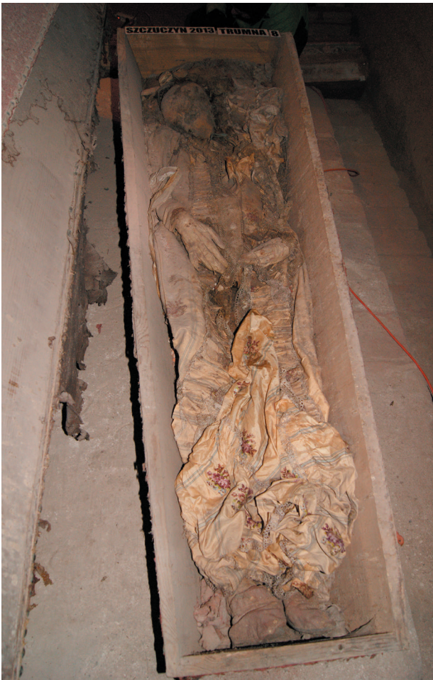
Fig. 4. Szczuczyn, western crypt, part A. Burial no. 8 – in situ.

made of green taffeta, with the cut a'la déshabillé . The dresses were complemented by a number of clothing accessories – mesh gloves, a silk cap, and a scarf with a printed floral and geometric pattern (Grupa 2012a; Przymorska-Sztuczka 2013, 215; Dobek 2022, 36–37). As of today, the historical material related to the burials of women from Szczuczyn has not been published in a monographic form, but now, on the basis of field documentation and laboratory analyses, it is possible to define the collection in Szczuczyn as exceptionally diverse and contributing considerably to the cross-sectional knowledge of women's fashion functioning in the territory of the Republic of Poland in the 18 th and 19 th centuries. Bobbin laces, of which the largest number were recorded in Szczuczyn, are largely from women's graves. Additionally, a very reliable and valuable collection from a scientific point of view consists of the caps with which women placed in seven coffins were equipped (one cap was found in the layers of the threshing floor) (Przymorska-Sztuczka and Majorek 2013, 33–34).