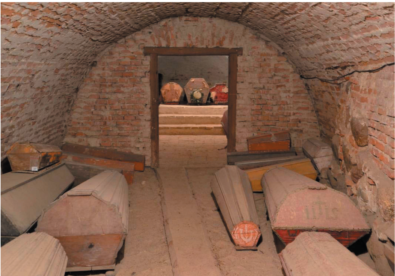
Fig. 2. Western crypt – view from the vestibule (part B) towards the catafalque (part A).