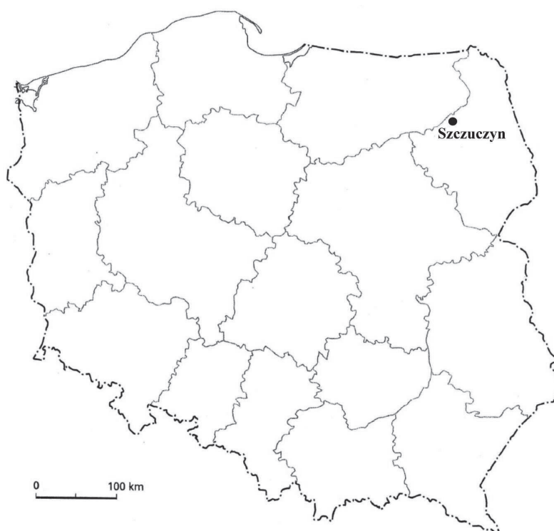
Fig. 1. Location of Szczuczyn on the map of Poland (compiled by J. Michalik).

As a result of this work, it was found that Szczuczyn is a unique site on the archaeological map of Poland – the microclimate prevailing for decades resulted in the preserved fabrics in over eighty burials (not only silk but also clothing made of linen, wool, and cotton fabrics), which provides a fresh opportunity