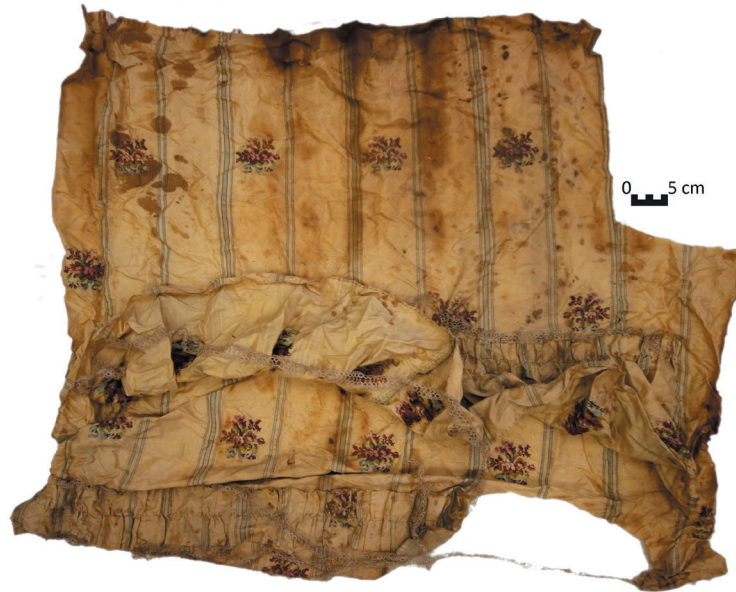
Fig. 5. Szczuczyn, western crypt, part B. Burial 8 – funerary dress during conservation.

they were machine-made from very good yarn, which translates into the high quality of the product (Grupa et al. 2013, 102; Dobek 2022, 49).