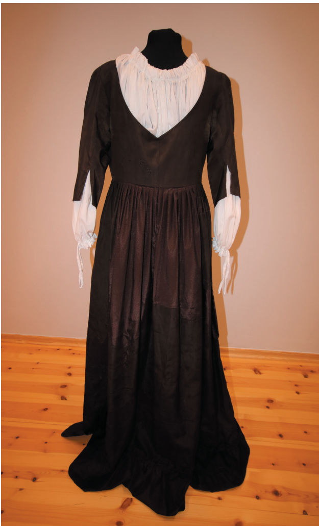
Fig. 7. Szczuczyn, eastern crypt, part A. Reconstructed tomb dress of Teresa Umińska.

buried in the neighbouring crypt. Despite the use of plain silk (currently dark brown in colour), the dress gave the impression of being sad and poor in relation to the above-mentioned (Fig. 7). The bodice was tightly fitted, lined with a lining made of three types of linen fabric and one cotton fabric. The sleeves were narrow, reaching to the elbow and also on the lining. The lower part of the dress from the waist down was arranged in centimetre pleats. The edge of the dress is decorated with a frill made of the same fabric (Grupa 2012a, 110–111). Both dresses are sewn in the same style, and there is a gap in the selection and finishing of details. In the first case, a festival of various top-class accessories, in the second case, there are no decorations, apart from a frill. One gets the impression that the owner of the brown dress was a working woman (this is confirmed by her biography as a secular sister of the Beguinage Order). On the other hand, the one with a light dress with lace was presumably a regular at salons, a woman that had been watched and admired.