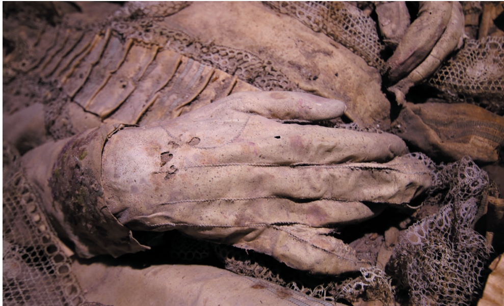
Fig. 6. Szczuczyn, western crypt, part B. Leather gloves from burial no. 8 – in situ.