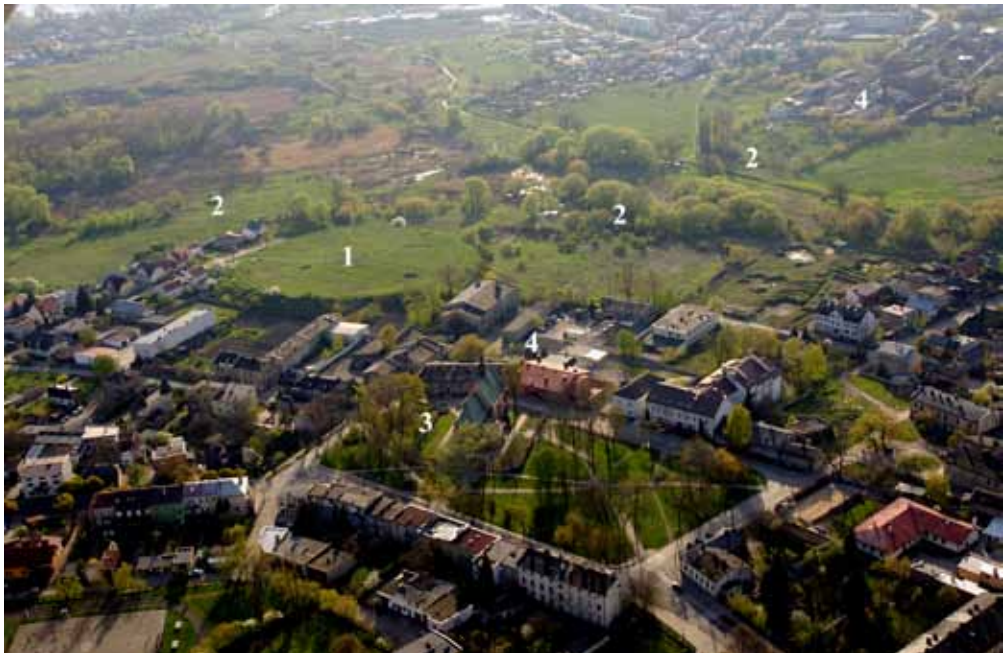
Fig. 1. Aerial view of the Mleczna river valley in Radom: 1 – stronghold, 10 th –14 th c.; 2 – open settlements, 10 th –12 th c.; 3 – settlement with St. Wenceslas' church, 13 th –14 th c.; 4 – industrial buildings, 19 th c. (Photo by D. Krasnodębski, edited by M. Trzeciecki)

The stronghold in Radom was investigated already in the 1960s. Regrettably, the results have not been published yet (Fuglewicz 2013, 11–30, with further literature). The site's entry in the National Heritage list, accomplished in 1972, appears to be the most permanent legacy of the excavations. Concurrently with the excavations, a project of an archaeological open-air museum was created, revisited by the city authorities after 40 years, owing to the fact that the stronghold had become a part of a multi-hectare wasteland as a result of long-term negligence and degradation of the urban tissue. A new research project, carried out in 2009–2013, was to precede the revitalisation project of this highly deteriorated area. Its main goal was the acquisition of archaeological data, which was indispensable for designing a strategy for the conservation and exhibition of the early medieval settlement complex (Trzeciecki 2013a; 2018a, 10–15).