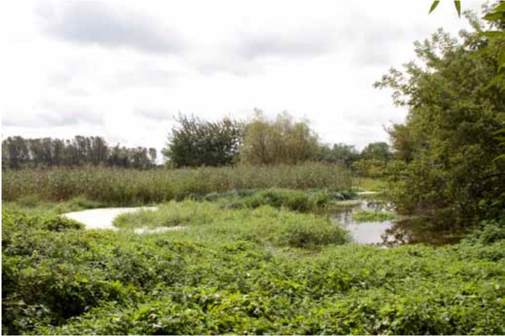
Fig. 4. Marshlands in the vicinity of the stronghold in 2012

Both the oppressive regulations of the heritage board and the spatial development plans completely stopped any investment activity in Old Radom, particularly the conservation of the drainage system. Already at the end of the 1970s, the Mleczna river valley changed back into a swamp, systematically fed not only by river outflows but also by municipal sewage (Fig. 4). What area remained accessible became a place of illegal storing of rubbish from around the city (Szwarczewski 2013, 143). A lack of decisions concerning the future of this place and a lack of perspectives contributed to the social marginalisation of Old Radom and its inhabitants. Consequently, St. Peter's hill quickly gained the reputation of one of the most dangerous places in Radom (Trzeciecki 2018b, 136–137). Among the side effects of administrative decisions, a spontaneous and uncontrolled re-naturalisation of the valley is of particular importance. Within a dozen or so years after human activity was halted, plants of the forest habitat came back, and the area became a shelter for many species of wildlife. Moreover, some elements of the newly created ecosystem are now under strict protection as rare or endangered species (Kocik et al. 2012).