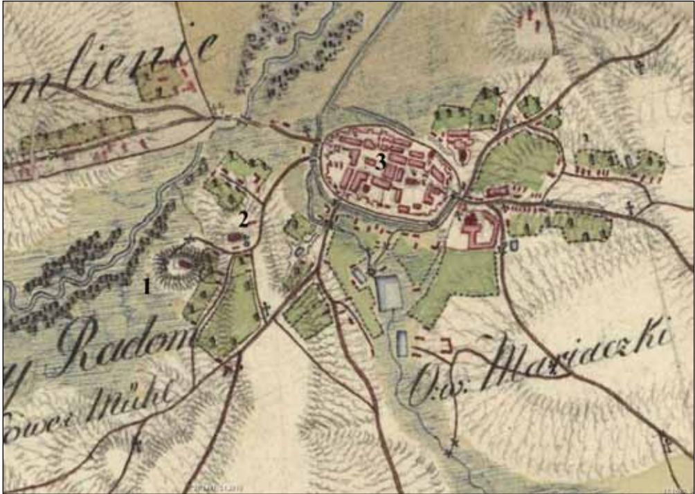
Fig. 3. The city of Radom on the map of Meyer von Hendsfeldt (1804): 1 – stronghold with St. Peter's church; 2 – Old Radom; 3 – New Radom

during the entire 16 th century. A deforested section of the valley was a reservoir of forage, mainly for cattle but also sheep, whose breeding was of considerable importance for drapery manufacture. The second important element was the construction of water-powered grain mills (Sowina 2011, 193–194). In the following centuries activity in the Mleczna valley gradually ceased. Due to the total felling of forests, the riverbed became shallow and the river started to spill over the valley, which quickly turned into a swamp (Szwarczewski 2013, 141–142).