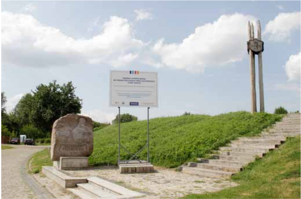
Fig. 5. “Signs of memory” at the foot of stronghold ramparts, 2013

Restoring the memory of St. Peter's hill as a historical place began in the early 21 st century. Local activists attempted to regain the historical “cradle” of Radom – seemingly lost forever. It is worth taking a closer look at these activities, which are a record of bottom-up, spontaneous creation of the “place of memory”. They started from a systematic cleaning of the area, as well as a struggle with the illegal dumping of garbage. Then, a somewhat “postmodern” conglomerate of memorials emerged – three wooden piles exemplifying the fence of the stronghold, a stone with the image of Mieszko I, and a cross in the middle of the stronghold, along with an information board conveying a mythologised version of the stronghold's history (Fig. 5). Such activities were accompanied by attempts to arrange social events, such as archaeological picnics, together with the Museum of Radom and local re-enactment groups (Morgan 2013, 284–288; Trzeciecki 2018b, 137–138).