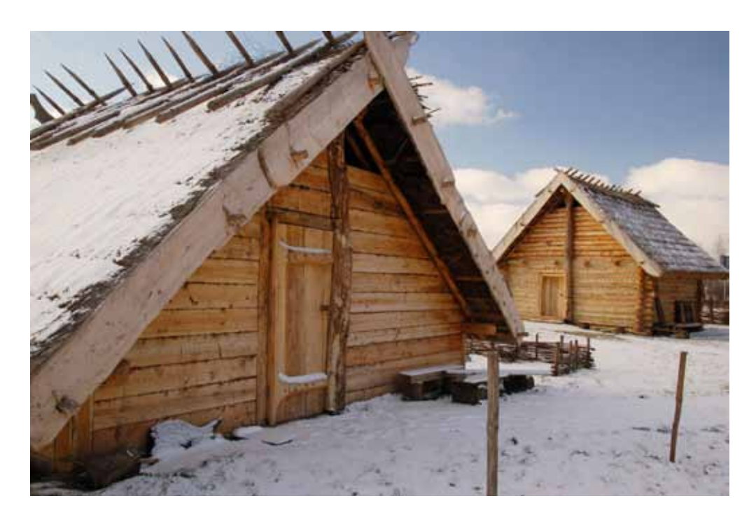
Fig. 9 and Fig. 10. Reconstructed cabins in the Goths' Village