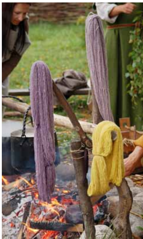
Fig. 6a and Fig. 6b. Popularisation through the recreation of old wool dyeing techniques

of spending free time. The bottom-up initiative to create a memorial of the archaeological excavations transformed into a social and educational project. It quickly turned out that the skills learned by the "new" Gothic community are desirable to the pupils and teachers from local schools. Living history lessons became an important element of the daily life in the village, which initially brought only satisfaction, but later also became a source of income.