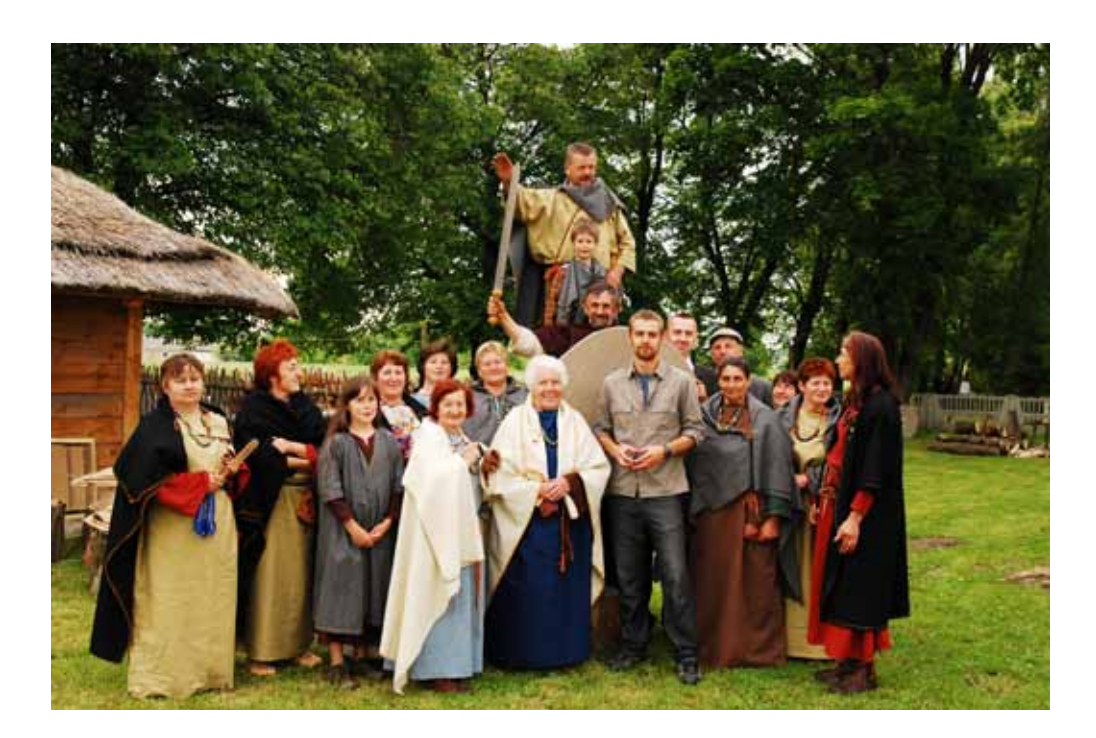
Fig. 4. First steps towards creating a Gothic group

The first, most important, innovative project aimed at promoting Masłomecz's archaeology and the archaeological heritage of the region was called "Remnants of the Goths - prehistory of the land of Hrubieszów as an element of the European cultural heritage". It was implemented from March to September 2007 by the "Better Tomorrow" Hrubieszów-Mircze Society Local Action Group, under the Pilot Project Leader + Scheme II in the municipalities (gminas) of Hrubieszów and Mircze. The project's main objectives were to promote cultural heritage and to increase the tourism attractiveness of the municipalities