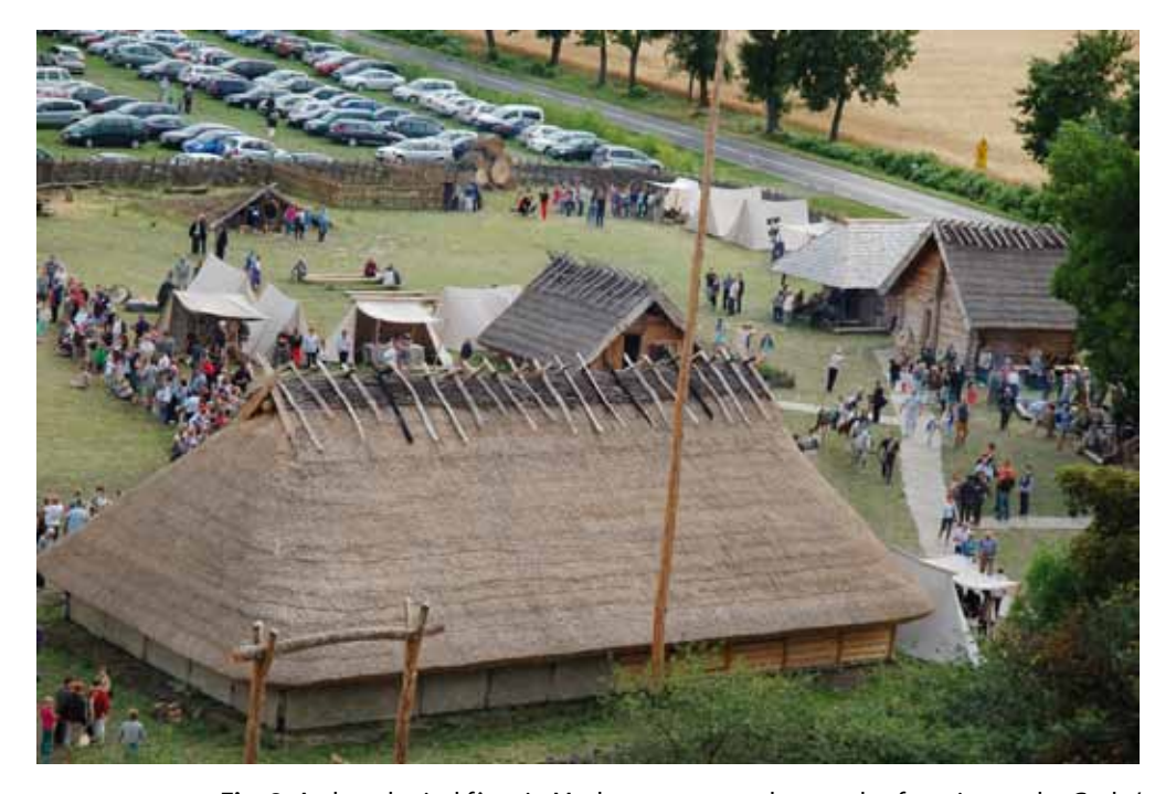
Fig. 8. Archaeological fêtes in Masłomęcz attract thousands of tourists to the Goths' Village

As a result of the involvement of many people (enthusiasts, scientists, and members of the local authorities), it has been possible to interest the public in the local archaeological heritage without the need to emulate foreign models. Cherven' Towns and Bolesław the Brave's campaign against Kiev in 1018 are talked about here with equal passion as the Gothic funeral customs. Good cooperation, and the local teachers' approach, plays the key role here. As a result of the initiative of a few teachers from the local schools, it was possible to organise classes about the Goths and prepare students to test their knowledge in archaeological contests. A skilful and attractive way of conveying information about the discoveries and participation in events organised by scientists from around the world also made it possible to stir people's imagination with regard to small finds found on regularly ploughed fields. This imagination, shaped - to an extent probably unknowingly - by the archaeologists from Lublin, brought results directly after the excavations had finished. The bottom-up initiative of the local community, the motivation to act in the local environment, and openness to innovative