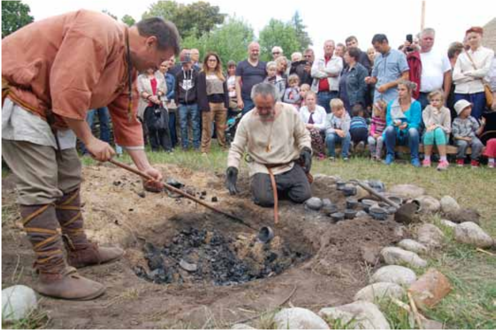
Fig. 5a and Fig. 5b. Experimental archaeology illustrated by firing ceramics