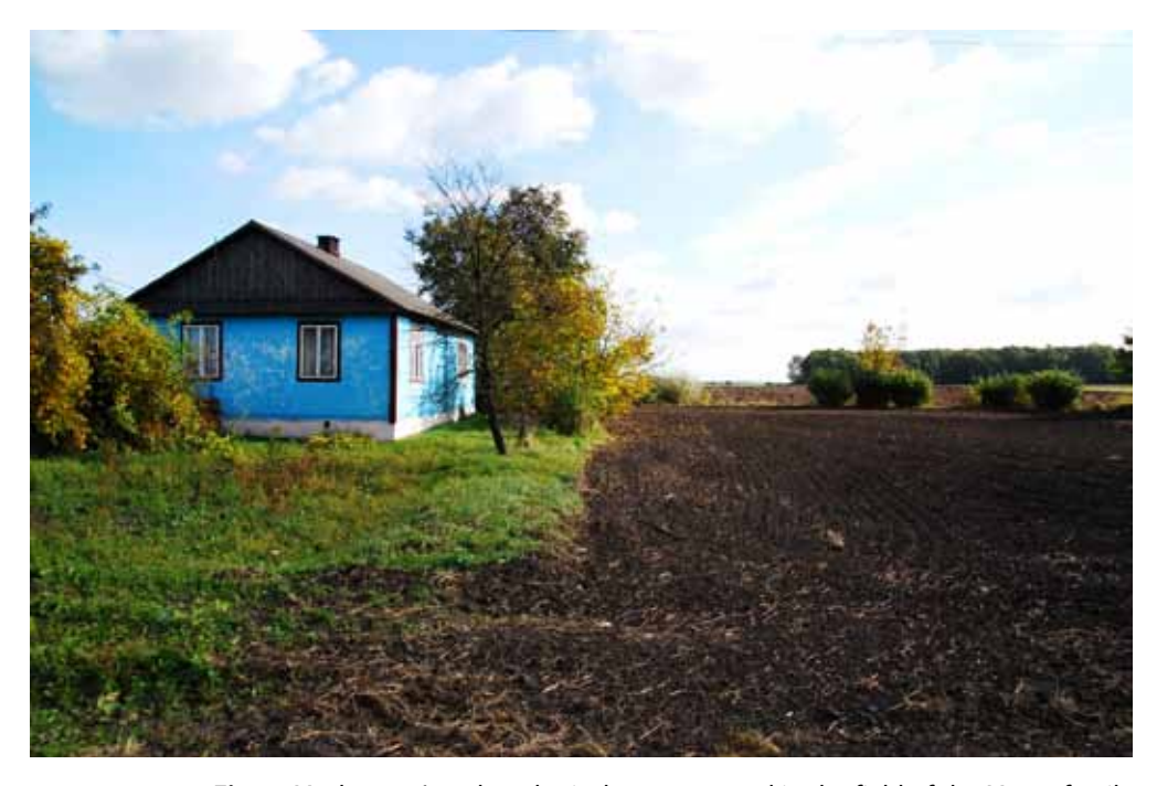
Fig. 1. Masłomęcz's archaeological career started in the field of the Mazur family