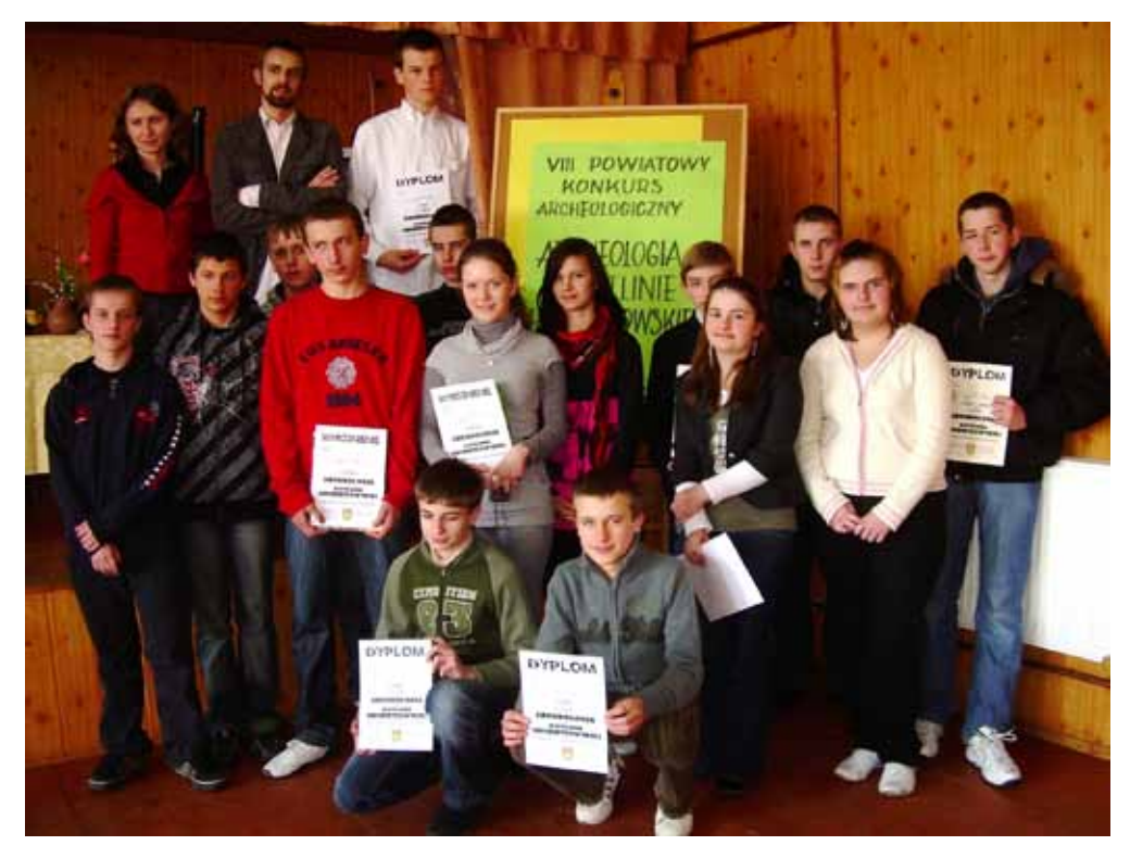
Fig. 3. The education of the youngest generation became one of the Hrubieszów Museum's projects

award called "Laur Masłomęcki" ("The Masłomęcz Laurel"). This was done to honour people who made particularly special contributions to building the cultural and economic image of the Land of Zamość. "The Masłomecz Laurel" is a small statuette of a bird-shaped fibula, which is regarded as the symbol of archaeology in Hrubieszów and of the Gothic "Masłomecz group" (Kokowski 2014, 32-35). The award winners include archaeologists, museologists, and politicians (Fig. 3).