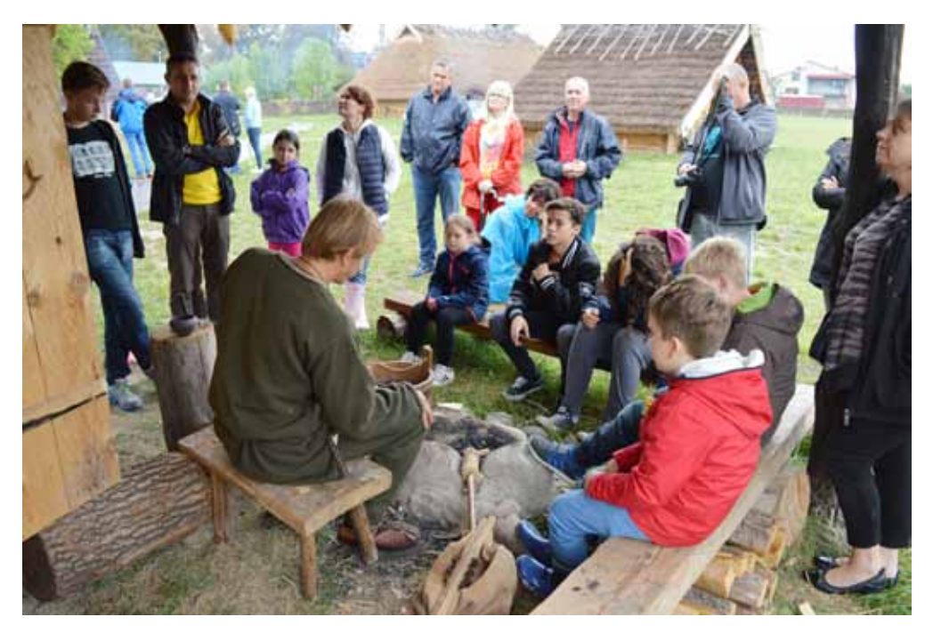
Fig. 11. Living history lessons in the Goths' Village have become a tourist attraction for all age groups

ideas started a completely new chapter in the history of Masłomęcz, where the Goths returned to the Hrubieszów Basin.