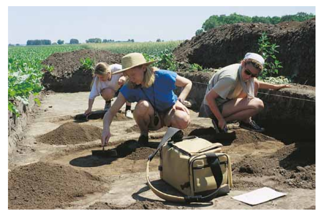
Fig. 2. The excavations in the region provided a lot of interesting information and valuable exhibits for the Museum

contained dishes, ornaments and garment parts made of gold, silver and bronze, combs, as well as glassware, which was very valuable in Antiquity (Fig. 2).