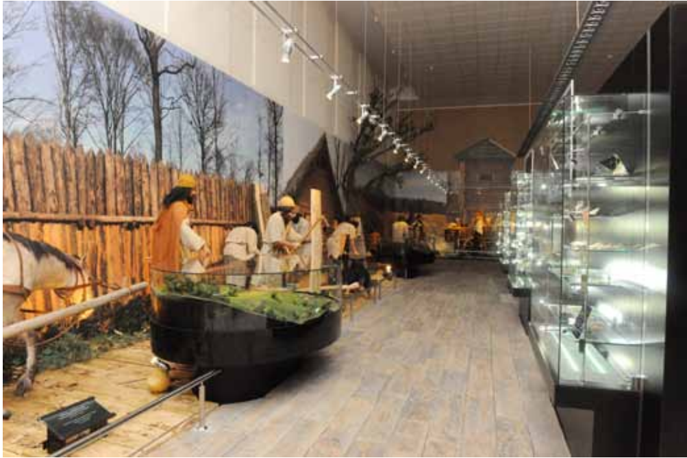
Fig. 10. Exhibition pavilion – permanent exhibition

Open-air archaeological exhibitions have become enormously popular, though they do not always show the historical truth. Archaeological open-air museums are becoming an increasingly popular form of presenting achievements of archaeologists around the world. They enjoy the respect of visitors and are becoming an important factor in the development of regions, as well as exploring the most distant past by European societies. However, some forms of reconstruction or reenactment are often based on figments of imagination rather than on the results of archaeological excavations.