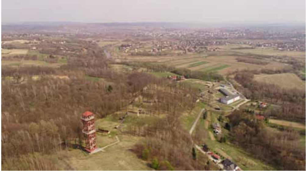
Fig. 7. Bird's eye view of Carpathian Troy