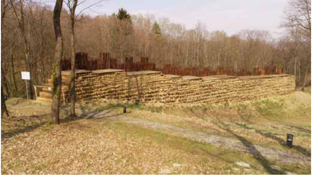
Fig. 13. Reconstruction of the early medieval alternating-layer earthwork

Ages. The reconstructed hillfort is an astonishing exhibition itself. The pavilion boasts a modern exhibition of artefacts found in Trzcinica, showing the visitors the culture of the community inhabiting this area in the Early Bronze Age and in the Early Middle Ages, which includes a reconstruction of scenes of daily life and models of the discovered defensive settlements (Figs. 14–15).