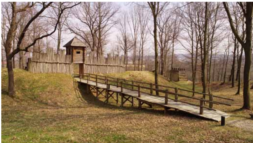
Fig. 3. Palisade earthwork and gatehouse of the Slavic hillfort