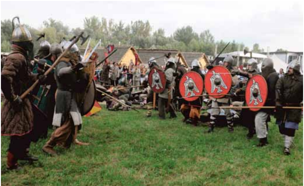
Fig. 17. "Two Images" Carpathian Archaeological Festival in 2012