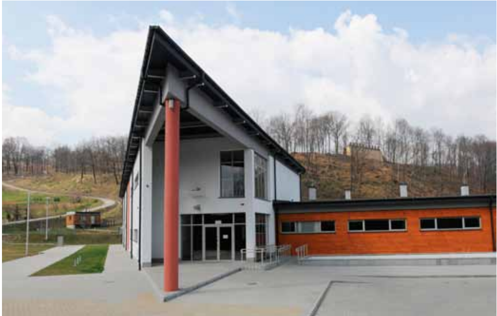
Fig. 14. Exhibition pavilion with the hillfort in the background