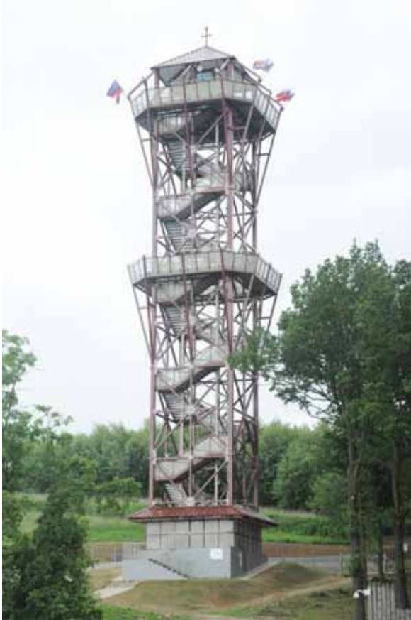
Fig. 11. Viewing platform

Later, in 2013–2014, a viewing platform was built in the highest part of the hillfort, as part of a cross-border Polish-Slovakian project (Fig. 11). The 44-metre-high tower allows tourists to look over the whole the Carpathian Troy Archaeological Open-Air Museum and admire the monumentality of the hillfort and the panorama of the Carpathian Foothills and the Low Beskids. A swivel webcam allows everybody to see Carpathian Troy on the internet. As part of subsequent cross-border Polish-Slovakian projects, an educational shelter was built in the Archaeological Park, resembling the post-and-beam houses of the Otomani-Füzesabony Culture.