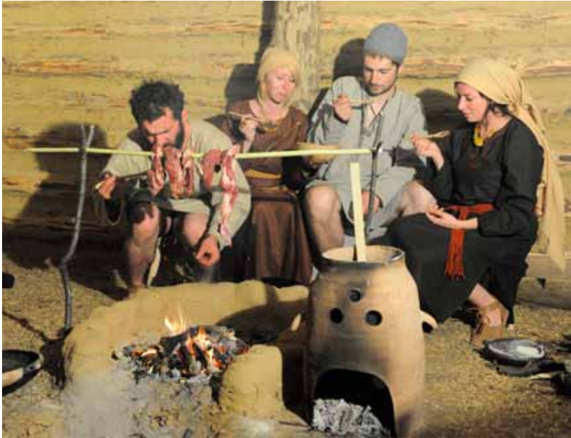
Fig. 16. Having a meal