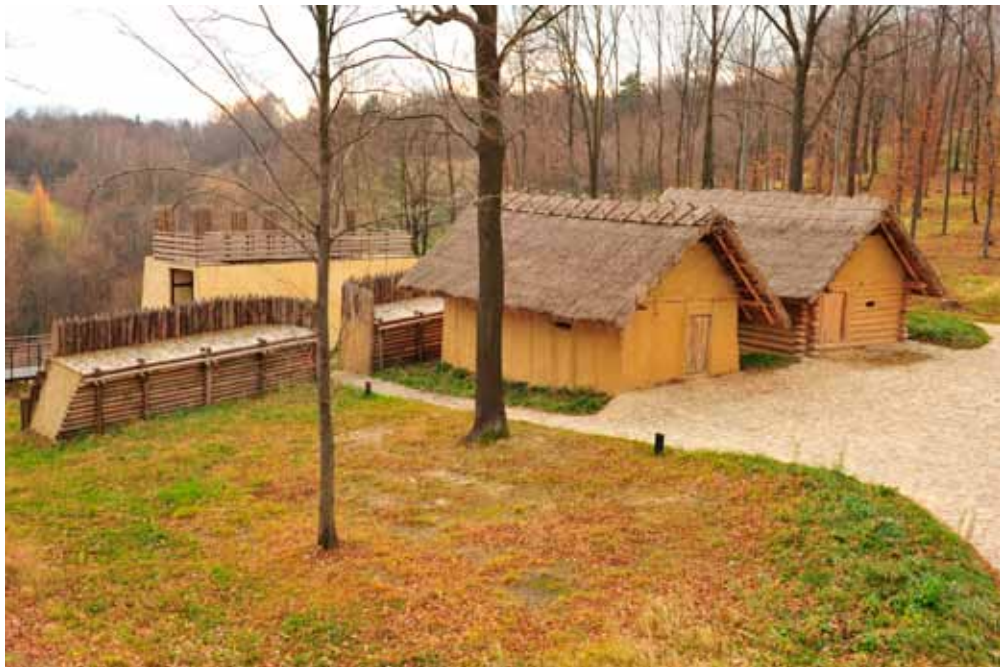
Fig. 2. Otomani-Füzesabony Culture cottages