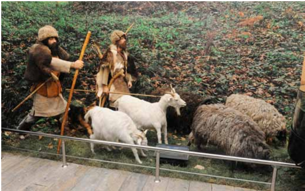
Fig. 15. Permanent exhibition – shepherds from the Late Stone Age