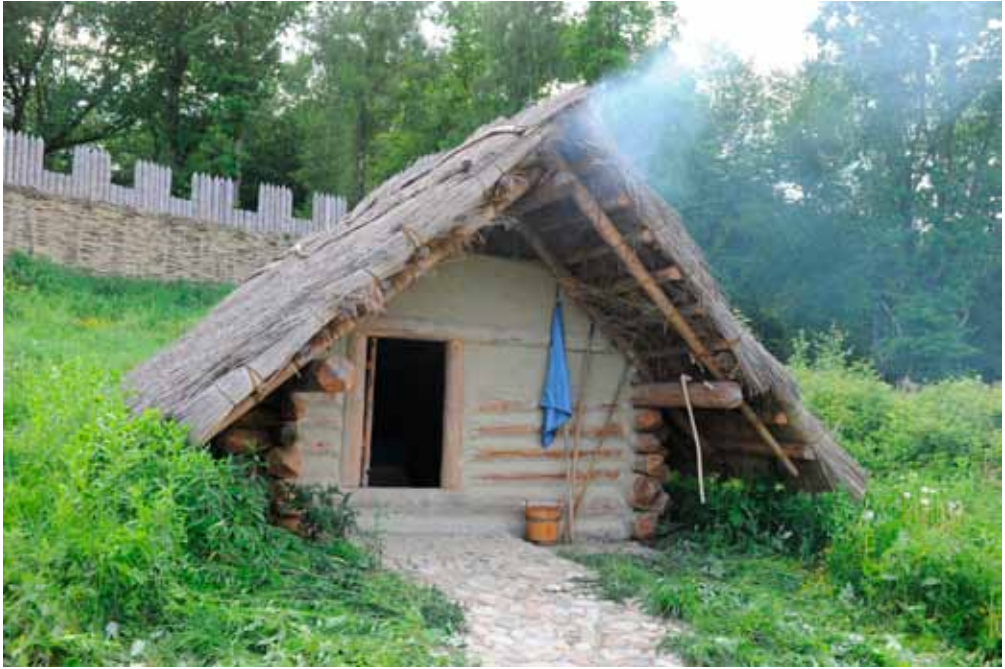
Fig. 4. Slavic semi-sunken pit-house and part of the wattle-and-daub earthwork (9 th c.)

facilities, technical and visitor support, workshops, labs, a reception desk, rooms for scientific work, workshops, guest rooms and a garage. The first floor comprised a restaurant and a Young Explorer's Room for children, a multipurpose conference room and toilets. The building was equipped with all the required utilities, installations and equipment. The settlements reconstructed in the Archaeological Park were an Otomani-Füzesabony settlement from 3,500 years ago, consisting of 6 houses, and a Slavic village from the 9 th c., composed of 6 cottages. All the buildings were created using prehistoric and early medieval technology. The basic materials used for the construction of the houses of the Otomani-Füzesabony Culture were wood, reed, straw and clay. These are post-and-beam houses with pitched roofs and plaited wattle walls of thin branches or reed daubed with an outer layer of clay, thatched with reed, as well as log houses. The early medieval houses are semi-sunken pit-houses and log houses. The reconstructed buildings also house recreated everyday objects. There is also a festival precinct and a 2,000 m 2 car park, as well as paths, paved roads and waterholes. The Archaeological