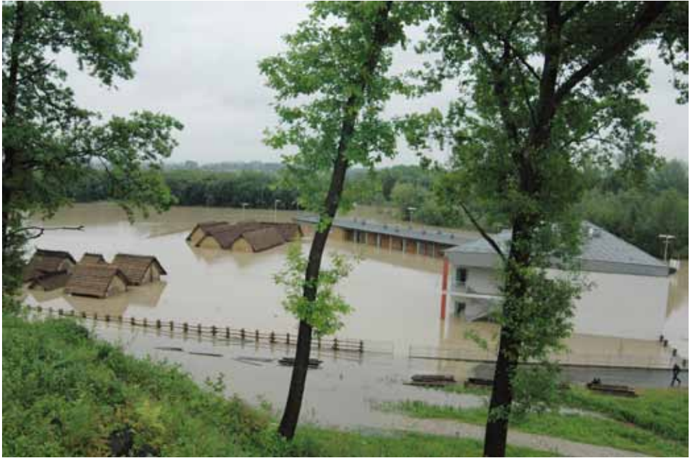
Fig. 9. Flooding in the Archaeological Open-Air Museum