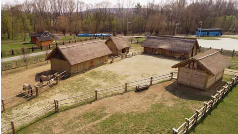
Fig. 12. Carpathian Troy – livestock sector

in Hanuszowce on the Topla river in Slovakia, and a mobile app was developed to facilitate the sightseeing tour. The yard next to the road leading to the Carpathian Troy Archaeological Open-Air Museum in Trzcínica was paved and additional buildings, such as the second educational shelter and toilets for reconstructors, were built. A livestock sector was created (Fig. 12), comprising two cowsheds and a barn. This was followed by the reconstruction of a 45-metre section of an early medieval alternating-layer rampart in place of a previously secured landslide within the walls destroyed in the 19 th c (Fig. 13). Patches with plants cultivated by the inhabitants of the Trzcínica hillforts at the beginning of the Bronze Age and in the Early Middle Ages were created in the vicinity.