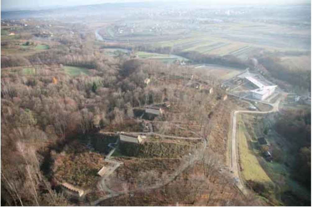
Fig. 6. Bird's eye view of Carpathian Troy

Park boasts a reconstructed early medieval blacksmith's shop situated near the Slavic village (Figs. 6–8).