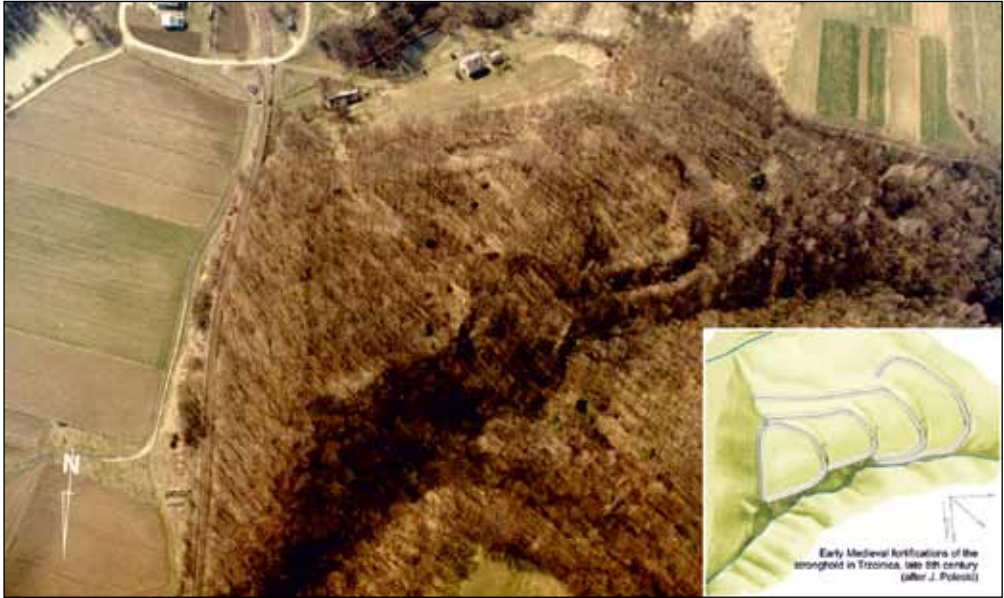
Fig. 1. Bird's-eye view of the Royal Earthworks

Its dimensions are 115 by 275 m. The present layout of the earthworks reflects the early medieval system of fortifications. The hillfort consisted of four distinct components: the main, one called the court and three wards (Fig. 1). On the west side, where the access to the hillfort was the easiest, three wards were built in the Early Middle Ages, surrounded by rings of ramparts at intervals of 60 to 70 m from one another. The earthwork around the first ward goes up to 5 m in height; the one around the second ward is the tallest and is over 9 m high and 22–24 m thick at its base. The earthwork around the third ward is the lowest and reaches 2 m. The walls around the first and second ward also protected a part of the hillfort's ward on the south side, and the wall around the third ward protected the second ward on the north. At present, the wall surrounding the third ward from the west and the walls surrounding the second ward from the south and north are the lowest. The remains of moats are clearly visible, which were not too deep and their bottom would frequently reach the strongly weathered bedrock. All the earthworks were built of earth and wood using the alternating-layer, palisade, latticework, and perhaps crate construction techniques. The wood usually used for the construction was the Quercus