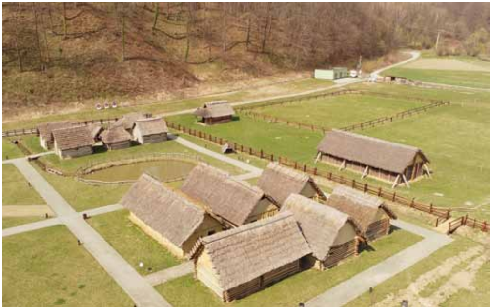
Fig. 8. Archaeological park with Otomani-Füzesabony Culture settlement, Slavic village, blacksmith's shop and educational shed