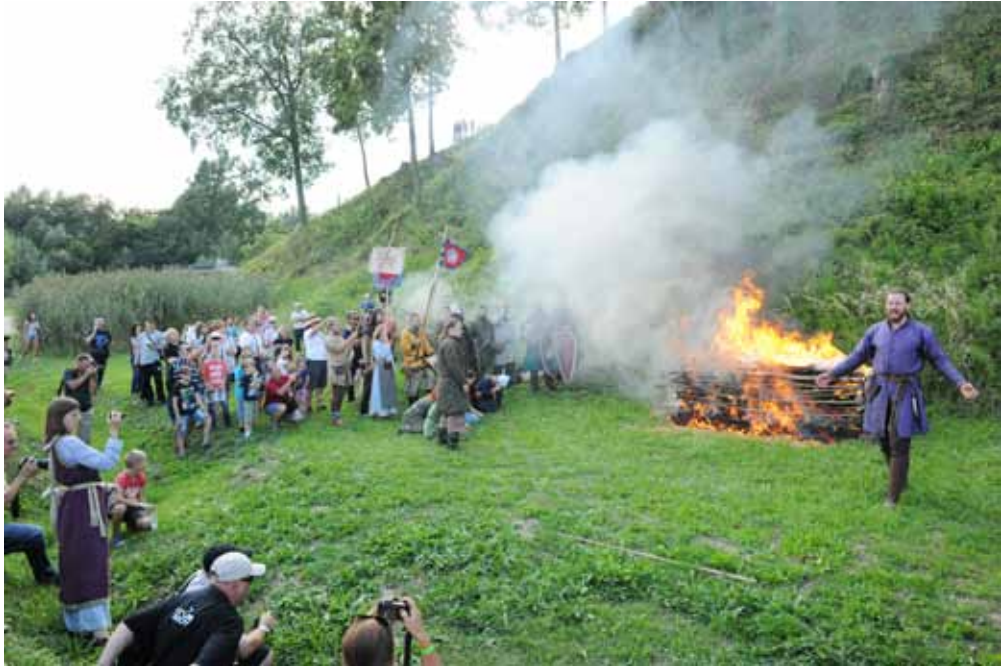
Fig. 18. Reenactment of a Slavic cremation funeral

here. Guests have the opportunity to tangibly experience the hardships of their ancestors' life thousands of years ago by living in the prehistoric cottage under the conditions of the era in which the dwelling was built. You can visit the Archaeological Open-Air Museum in Trzcínica using our mobile app as well. The construction of Carpathian Troy created new sources of income for the local community and new cultural and tourist products. The property has generated 26 new jobs and created the conditions for the development of the tourism infrastructure, including food outlets and production and sale of souvenirs. The place attracts about 50,000 visitors per year. The Archaeological Open-Air Museum guarantees a comprehensive offer addressed to people from different age groups who show various levels of interest in archaeology. It is a great opportunity for the development of tourism in the whole region, especially since there are many interesting sights and attractive natural areas here. The road and tourism infrastructure are also developing.