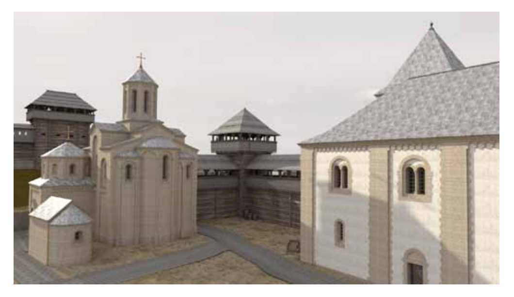
Fig. 5. White-stone princely palace and church, connected by a gallery passage (Reconstruction by A. Kharkhalis)