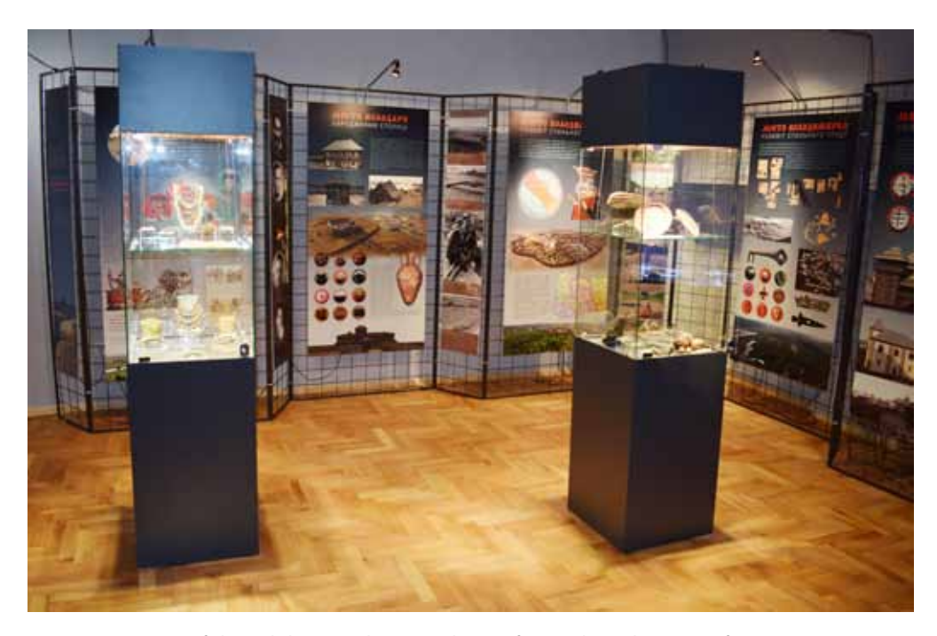
Fig. 4. Fragment of the exhibition "The capital city of Zvenyhorod – return from nonexistence"

from the princely era, in particular: the wooden church and the tanks on the detinets, from the second half of the 11th c., the stone church of the princely palace and the tomb on the okolny gorod; adjusting the Bilka river bed (as an element of the city's fortification system) to restore its shores to their natural appearance; and the revitalisation of the landscape of the river valley.