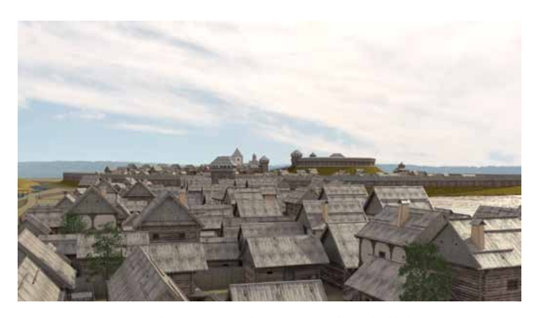
Fig. 6. North-eastern prigorod (Reconstruction by A. Kharkhalis)