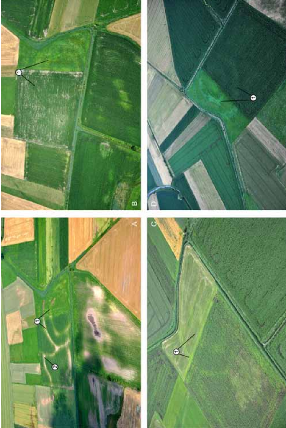
Fig 2. Borucin, site 1, Racibórz district: 1 – moats/ditches, 2 – former riverbed