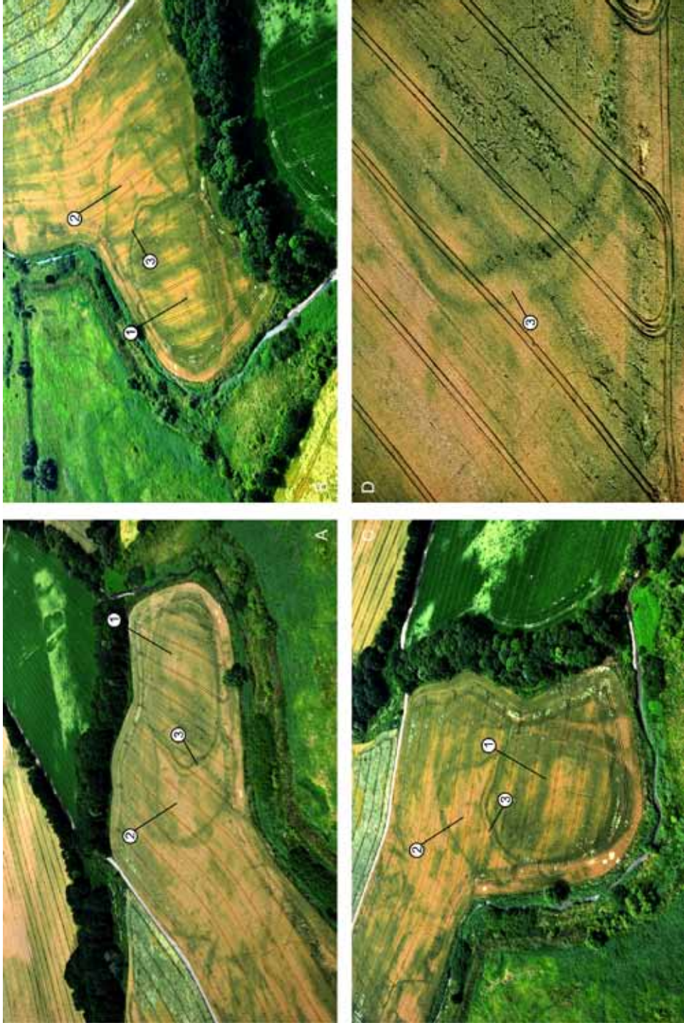
Fig 4. Gniechowice, site 1, Wrocław district: 1 – stronghold, 2 – suburbium, 3 – entrance?