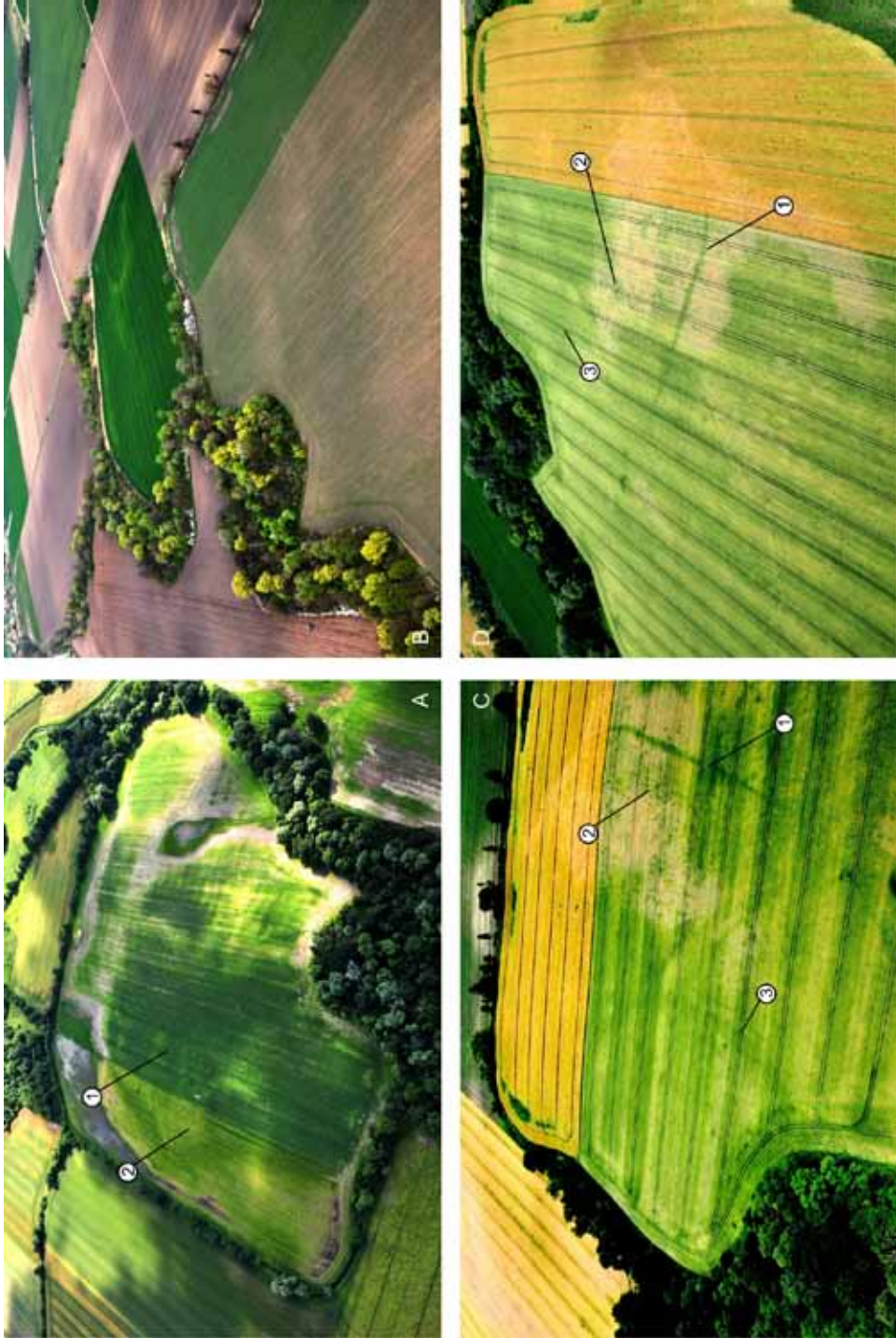
Fig 6. Stary Zamek, site 6, Wrocław district: 1 – outer moat/ditch, 2 – pit features, 3 – inner moat/ditch