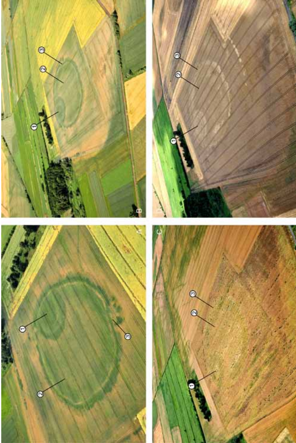
Fig 3. Chrzelice, site 1, Prudnik district: 1 – inner bailey, 2 – suburbium, 3 – entrance