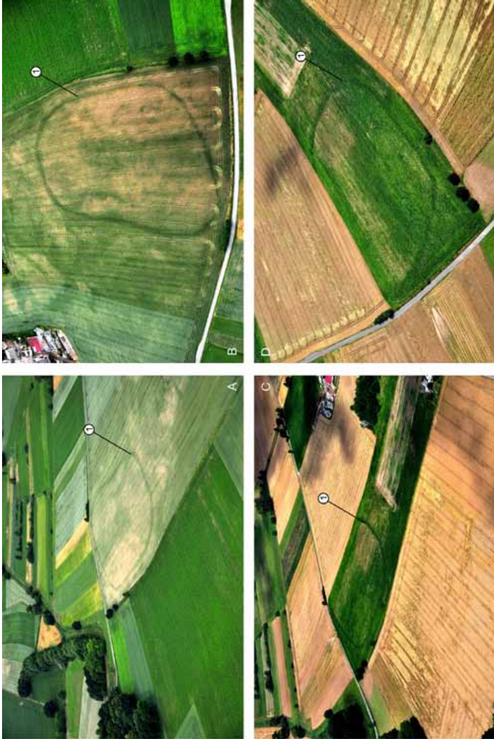
Fig 5. Komorno, site 1, Kędzierzyn-Koźle district: 1 – moat/ditch