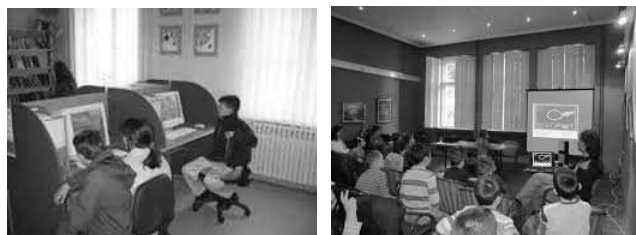
Fot. 1. Presenting the Children's Library before the planned reconstruction and some of the recent activities